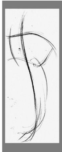
Charcoal or chalk pastel